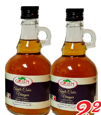
Apple Cider Vinegar Golden Plate 500ML