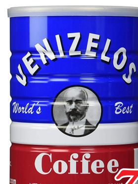
Ground Greek Coffee Venizelos 16OZ