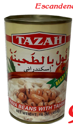
Fava Bean Tazah 16OZ