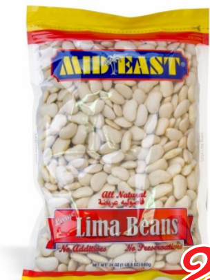
Large Lima Beans Mideast 24OZ