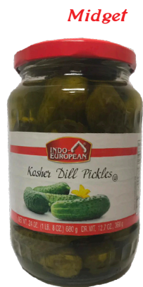
Kosher Dill Pickles Indo-European 24OZ