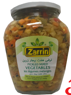
Mixed Pickles Zarrin 24OZ