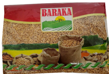
Durum Wheat Baraka 2LB