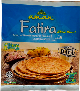
Whole Wheat Fatira Aman 6PC