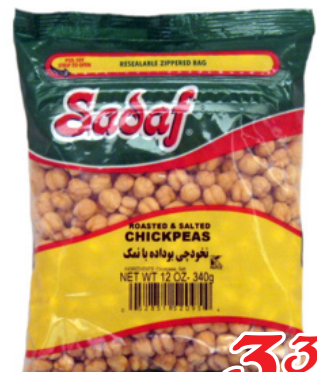
Golden Chickpeas Sadaf 12OZ