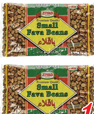
Small Fava Beans Ziyad 16OZ