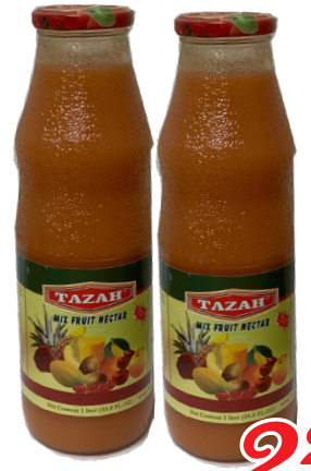
Cocktail Juice Tazah 1LT