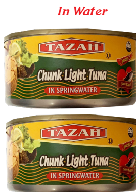
Tuna Tazah 6OZ