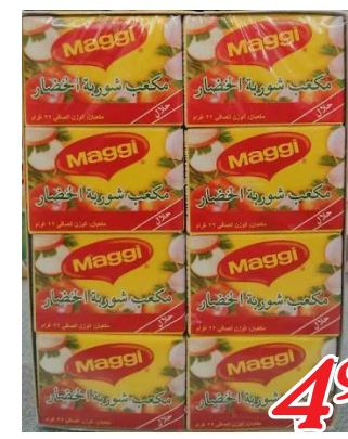
Vegetable Bouillon Maggi 24PC