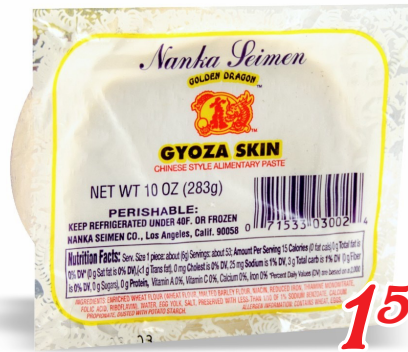
Gyoza Skin Dough Golden Dragon 100Z