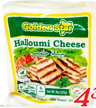
Halloumi Cheese Golden Star 8OZ