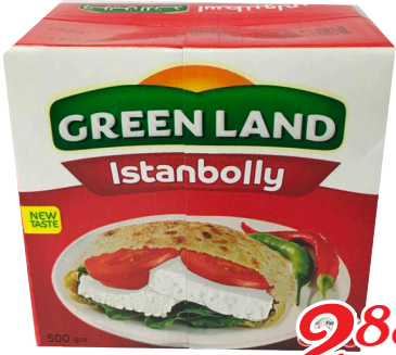
Istanboli White Cheese Greenland 1LB