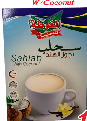
Sahlab Algota 150GM