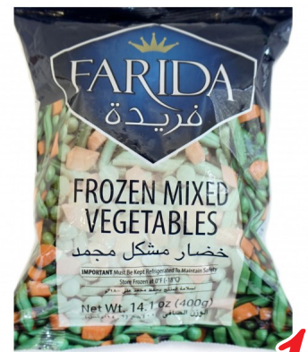
Mixed Vegetables Farida 400GM