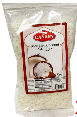
Shredded Coconut Canary 12OZ