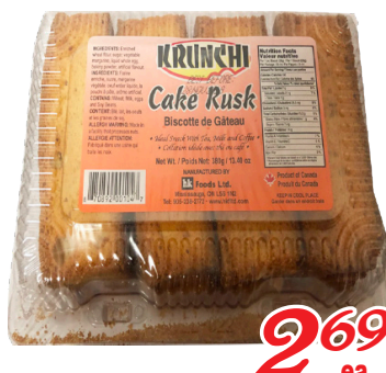
Crispy Cake Rusk Krunchi 380GM