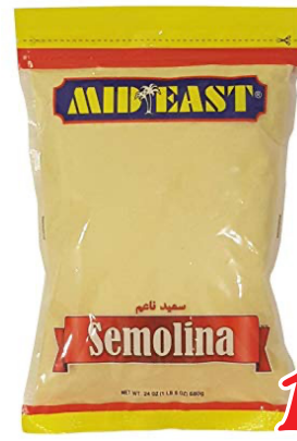
Semolina Flour Mideast 24OZ