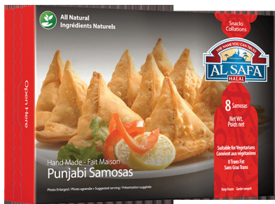
Punjabi Samosas Al-Safa 640GR