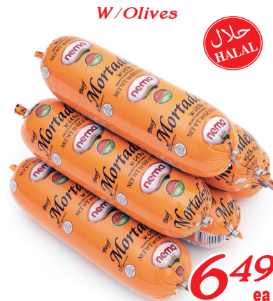
Beef Mortadella Nema 16OZ