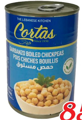
Chickpeas Cortas 15OZ