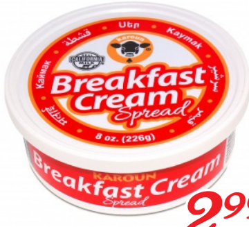
Breakfast Cream Cheese Karoun 8OZ