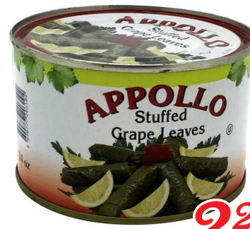
Grape Leaves Stuffed Appollo 14OZ