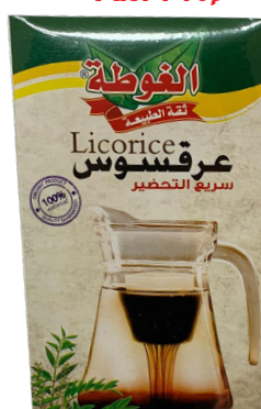
Licorice Tea Algota 150GM