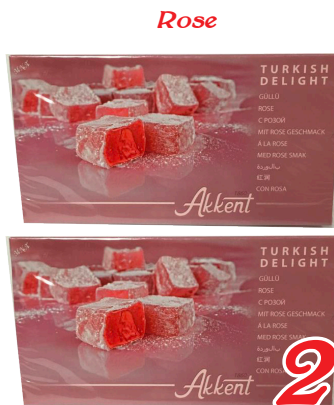
Turkish Delight Akkent 400GM