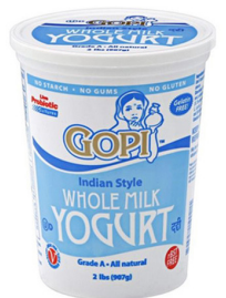
Indian Style Yogurt Gopi 2lb